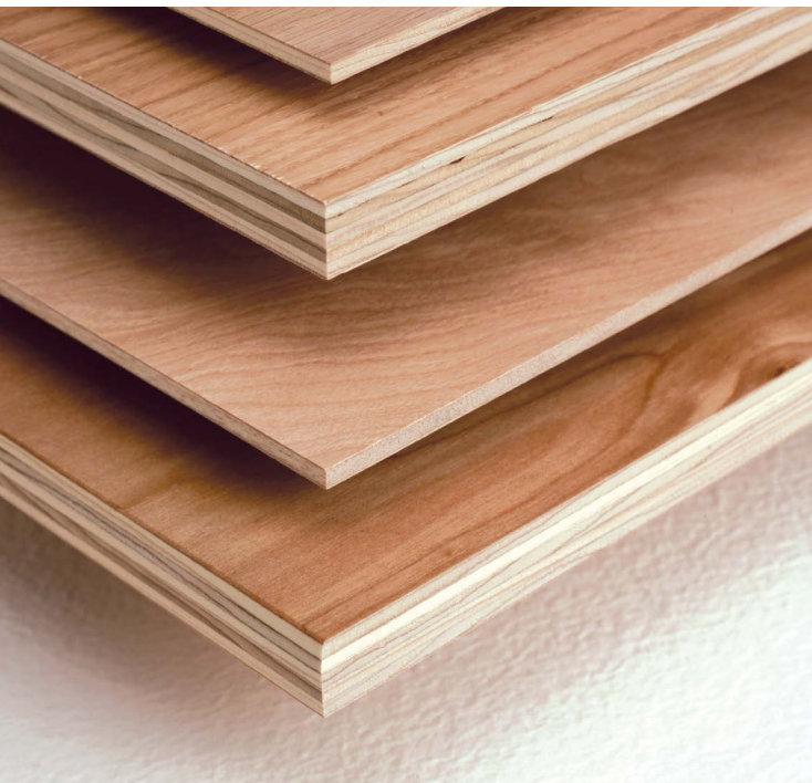
Hardwood plywood is manufactured to an aesthetic standard.

“Markets are trending toward products that have a good environmental story.”