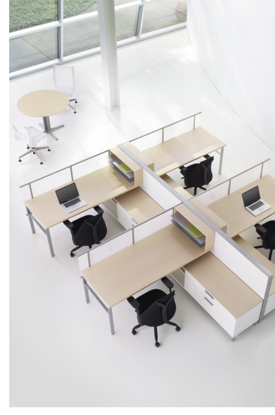
Canvas work surfaces.

Herman Miller sees constant growth in customer demand for FSC-certified products. Listening to customers who care deeply about purchasing responsibly sourced wood products, Herman Miller continues to expand the availability of their FSC-certified furniture.