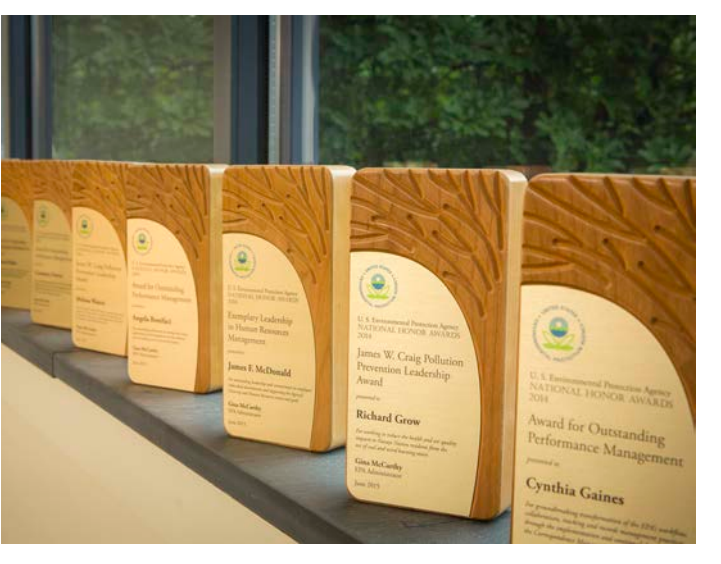
The Arbor Award in FSC-certified cherry. © Rivanna Natural Designs.

Rivanna Natural Designs started in 2001 with a simple objective: to create meaningful, rewarding, living-wage jobs for refugees, and to maintain the smallest possible environmental footprint.