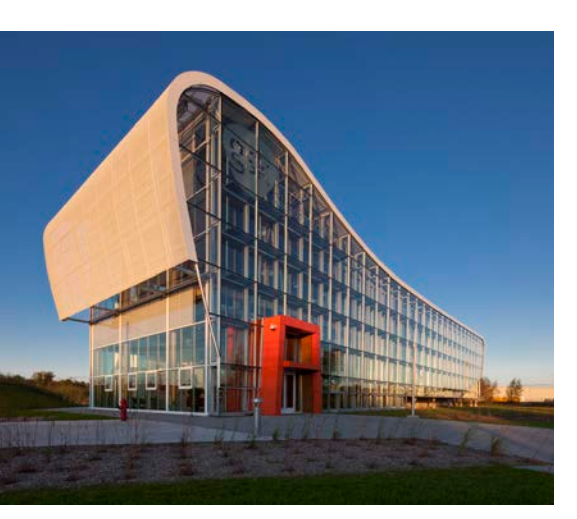
Nordic Structure's FSC-certified engineered timbers in new GlaxoSmithKline offices in Québec.

Nordic Structures is a Montreal-based company that develops and markets engineered wood products and building systems. The company's professionals provide engineering and management services for wood structure projects as well as technical assistance for product distribution.