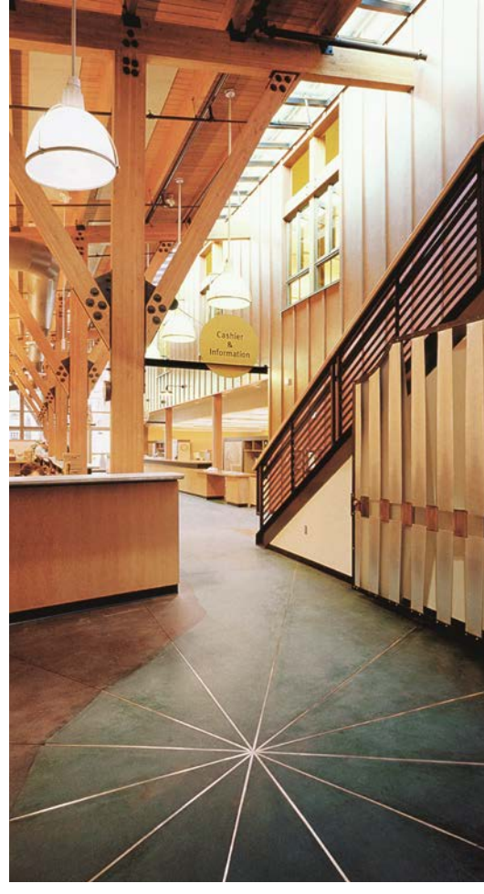
Bainbridge Island, Washington City Hall built with FSC-certified Collins wood.

Decades later, Collins commitment to FSC is undiminished, and no other forest management and wood products manufacturing company can claim as long and deep a relationship with the Forest Stewardship Council. Collins believes that third party, independent certification of forestlands is the best way to protect the legacy of the total forest ecosystem—now and into the future.