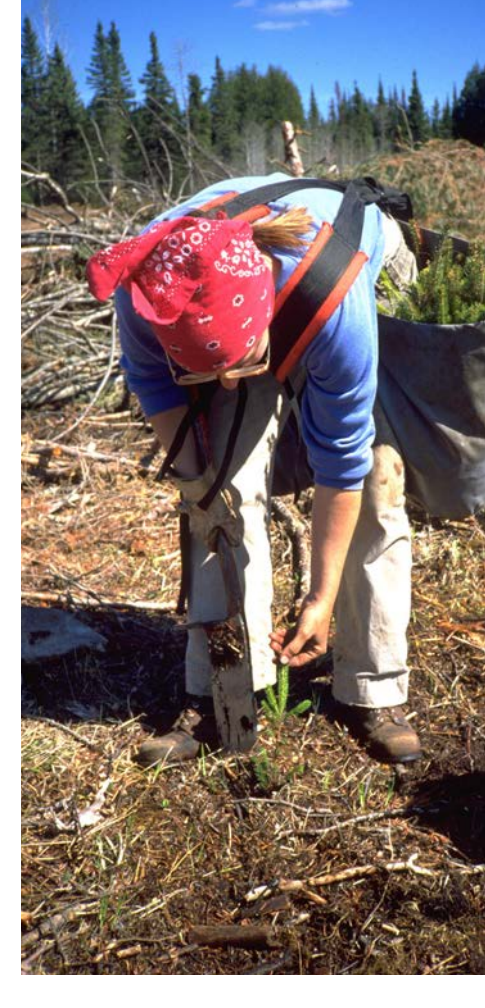
Replanting in Minnesota state forest.

Given the current stresses caused by invasive species, climate change, and other factors, managing responsibly is crucial for ensuring a long-term flow of forest products and revenue from the state's forestlands. Certification is likely to lead to increased future supply and revenue as a result of improved ecological and forest health conditions. In recent tough economic times, certification helped improve the market competitiveness of Minnesota's forest products.