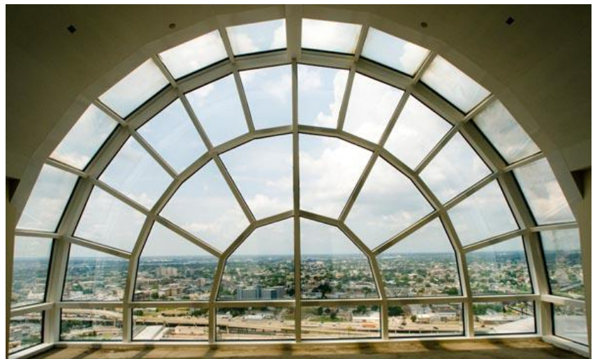
The view from Benson Tower in New Orleans: Headquarters of the New Orleans Pelicans and New Orleans Saints, and the first LEED-certified, high-rise commercial office tower in New Orleans.